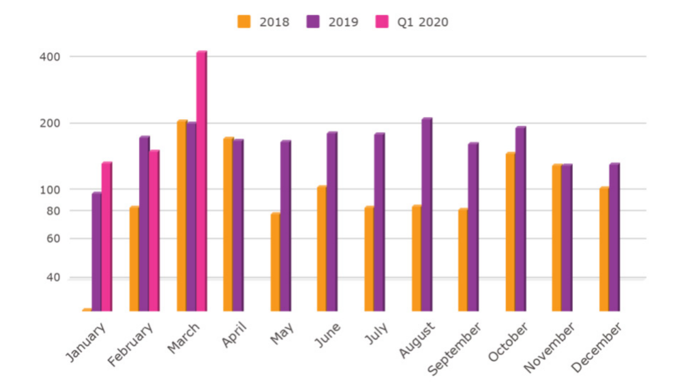
Table 1: Number of People Enrolled in Schemes through the Kendras

There is no formal system in place yet for union members to provide feedback on how the Kashtakari model is working. However, members have expressed that they appreciate that the KSKs are located in their neighborhood and are open in the