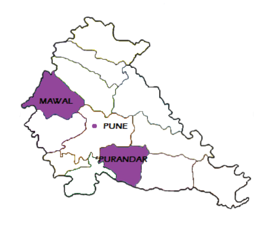
Figure 2: Study Areas in Pune City and District

The map shows taluka boundaries within Pune District. The colored sections indicate areas covered under this study.